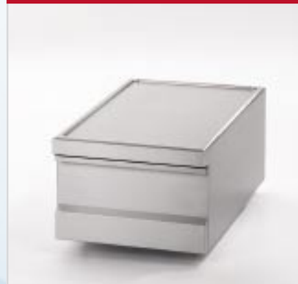
BistroLine Worktop (1/2) as a work and storage surface