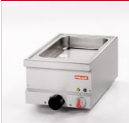
BistroLine Pan 400 Roasting, stewing, steaming, braising