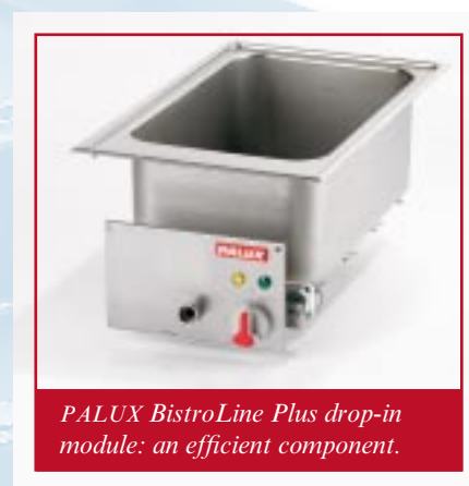
PALUX BistroLine Plus drop-in module: an efficient component.

A practical, modular and variable basement system facilitates perfect combinations to satisfy requirements. The PALUX BistroLine Plus basements , in standard or hygiene version, offer a wide variety of functions in numerous equipment variants. In addition, there are many useful details.