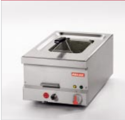
BistroLine Deep Fat Fryer for healthy, low-fat frying