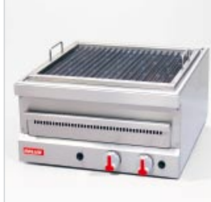
BistroLine Gas Grill for grilling and frying