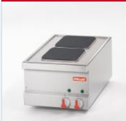
BistroLine 2-Plate Electric Range for cooking and frying