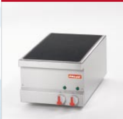
BistroLine Induction Range (1/2) for cooking and roasting