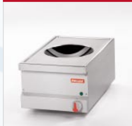
BistroLine Induction Wok (1/2) for health-conscious cuisine