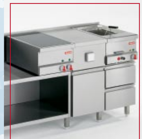
PALUX BistroLine Type 1 – for individual, flexible assembly, according to capacity and current range of meals offered, on closed basements with hygienical cover.