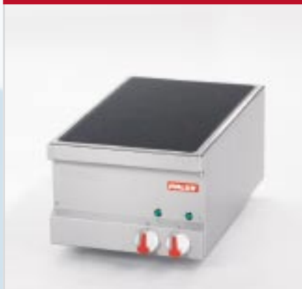
BistroLine Ceramic Range for cooking and roasting