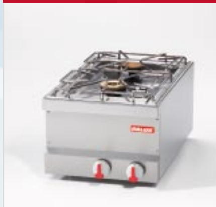
BistroLine 2-Burner Gas Range for cooking and roasting