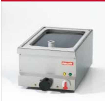
BistroLine Griddle Plate 400 for roasting and grilling