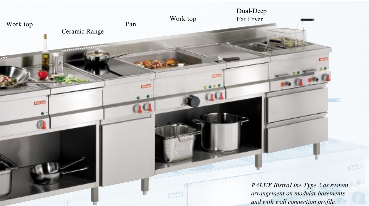
PALUX BistroLine Type 2 as system arrangement on modular basements and with wall connection profile.

... for flexibility and economical efficiency!