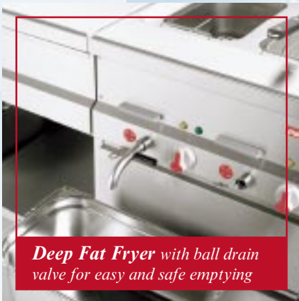
Deep Fat Fryer with ball drain valve for easy and safe emptying