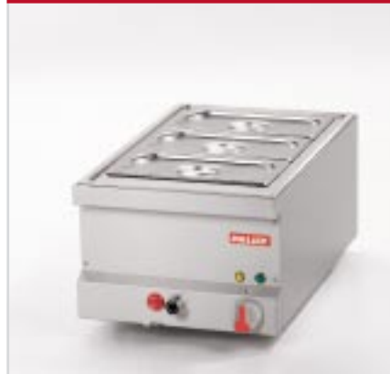
BistroLine Bain-Marie GN 1/1 for keeping food warm gently