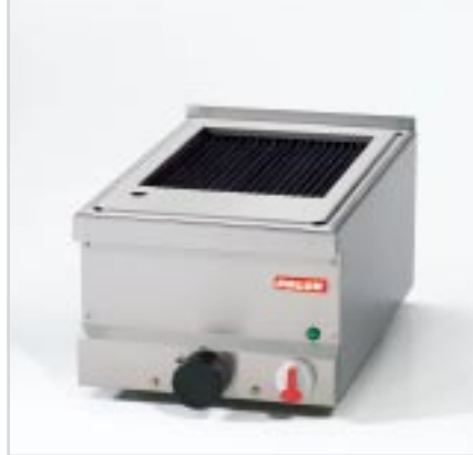
BistroLine Steak Grill 400 for grilling and roasting