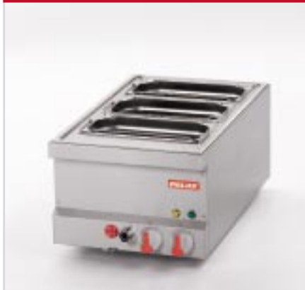
BistroLine Cooker GN 1/1 Boiling, slow-cooking, keeping warm