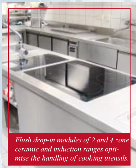
Flush drop-in modules of 2 and 4 zone ceramic and induction ranges optimise the handling of cooking utensils.