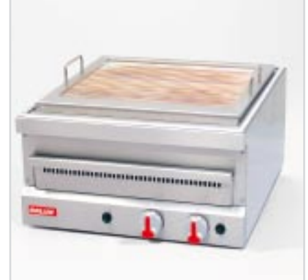
BistroLine Gas Lava Stone Grill for grilling and frying