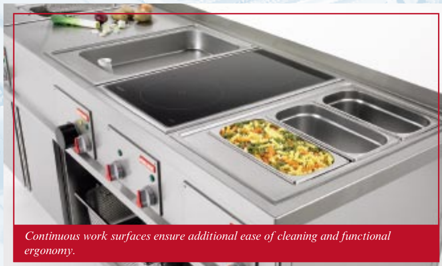
Continuous work surfaces ensure additional ease of cleaning and functional ergonomomy.