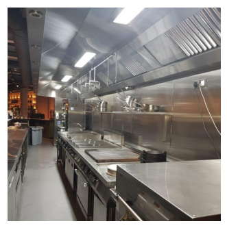
The ventilation canopy solution for solid fuelled cooking appliances.