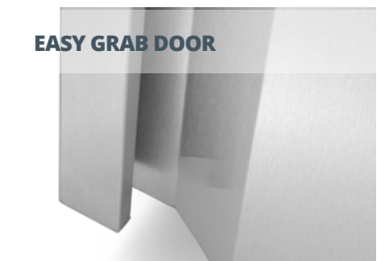
EASY GRAB DOOR