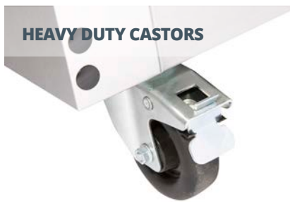
HEAVY DUTY CASTORS